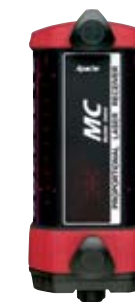
BULLSEYE 5MC Economic automatic control receiver Mini LED display for setup

BULLSEYE Models 5+ and 6 have additional features when used as indicate systems, specifically for use in excavating operations.