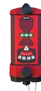
BULLSEYE 5+ Grading and Excavating Large LED display Plumb indication built in