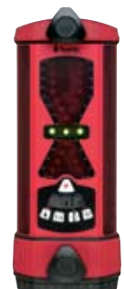
BULLSEYE 6 Grading and Excavating Extended reception height Angle Compensation for Excavators - ACE